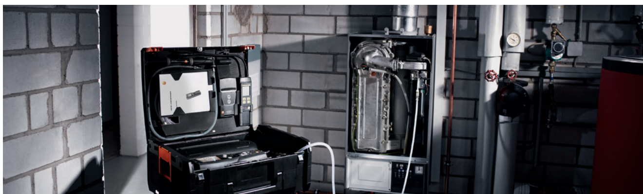
Automatic servicability test with gas-feed appliance with connection to the gas boiler