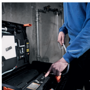
Automatic tightness test